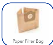
Paper Filter Bag