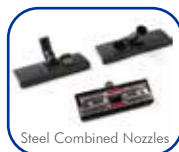
Steel Combined Nozzles