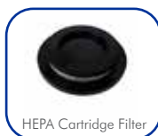
HEPA Cartridge Filter