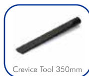
Crevice Tool 350mm