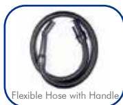
Flexible Hose with Handle