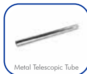
Metal Telescopic Tube