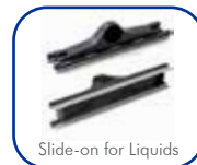
Slide-on for Liquids