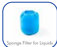
Sponge Filter for Liquids