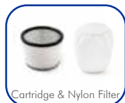
Cartridge & Nylon Filter