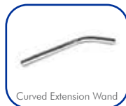
Curved Extension Wand