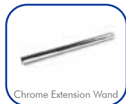
Chrome Extension Wand