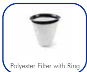
Polyester Filter with Ring