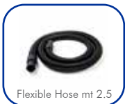
Flexible Hose mt 2.5