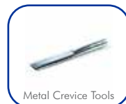
Metal Crevice Tools