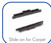
Slide-on for Carpet