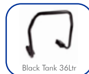
Black Tank 36Ltr