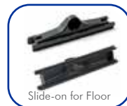
Slide-on for Floor